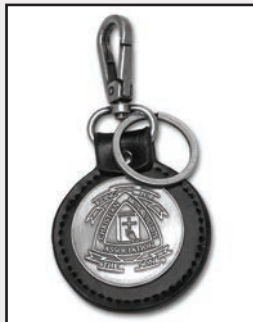
Logo Key Fob w/ Swivel Snap Rally Price $12.00