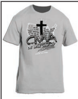
2017 National Rally T-Shirt w/ Logo $20.00 w/out Logo $15.00

After PM Service for 30 minutes each night except Saturday