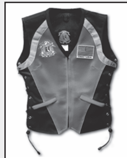
Women's Red Mesh Riding Vest Rally Price $70.50